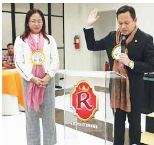
SDS Renante Solitario take his oath as the new SDS of Panabo City.