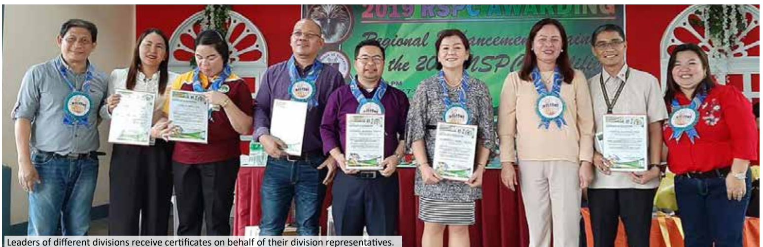
Leaders of different divisions receive certificates on behalf of their division representatives.

Digos City has two winners while the divisions of Mati City, Davao Occidental, and IGACOS have one representative for the individual contests.